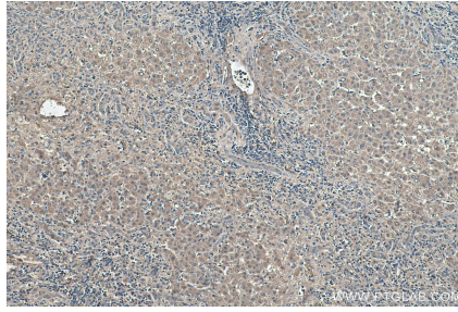
Immunohistochemical analysis of paraffin-embedded human liver cancer tissue slide using KHC0380 (AFP IHC Kit).