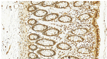
Immunohistochemical analysis of paraffin-embedded human normal colon slide using 14813-1-AP (HNRNPA2B1 antibody) at dilution of 1:2000 (under 20x lens). Heat mediated antigen retrieval with Tris-EDTA buffer (pH 9.0).